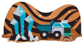
Precious Metals, Minerals, Rocks